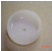
Optional Nylon Cap for Non-Carpeted Floors