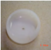
Optional Nylon Cap for Non-Carpeted Floors